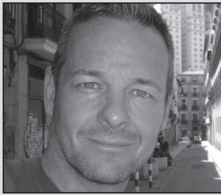
If you like keeping up with celebrities behaving badly, you'll love Bob King's "818."